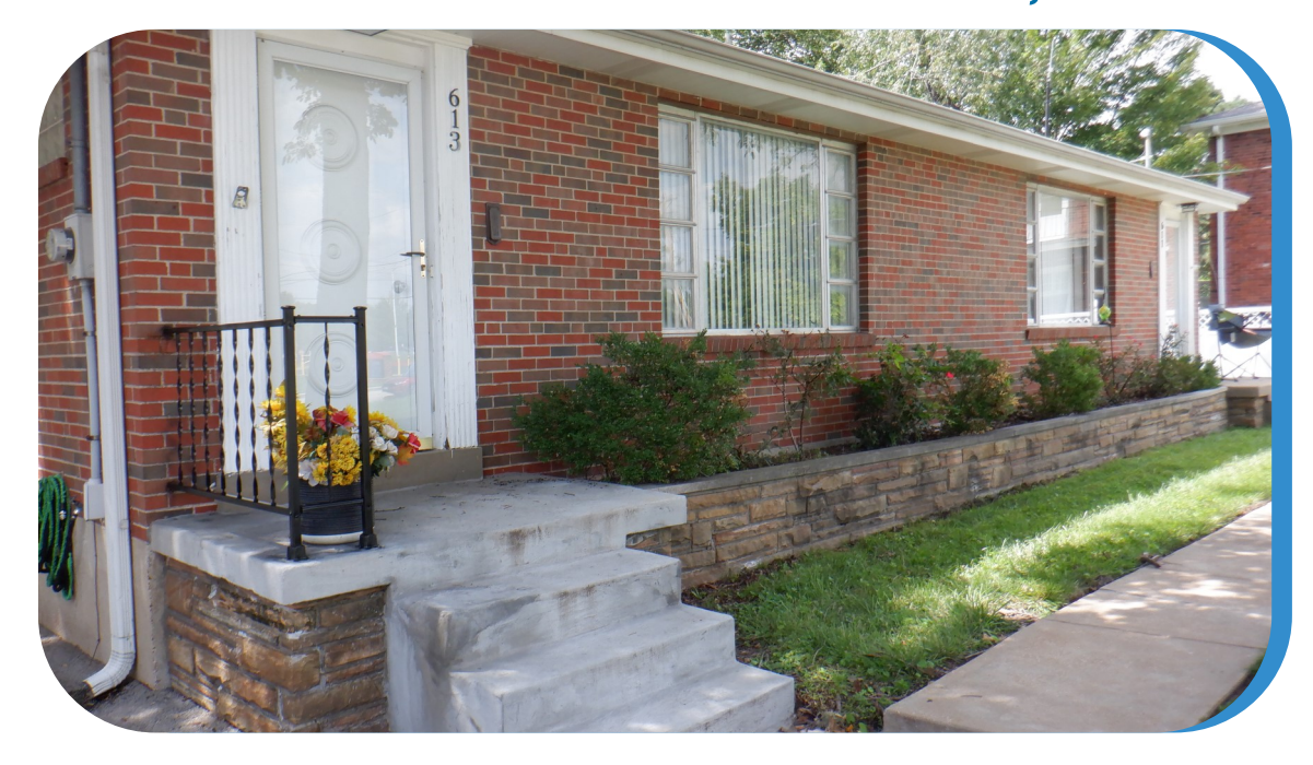
This property is located in the wonderful community of Kirkwood, has quick highway access, and is close to shops and restaurants!